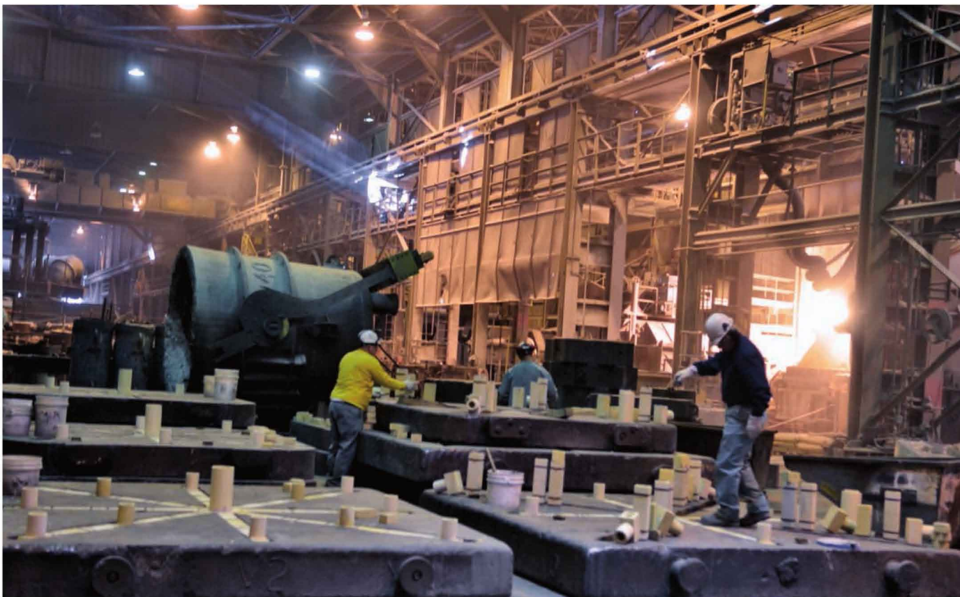
▲ A view of workers inside the Crucible plant. The company has operated in the Syracuse area since 1876.